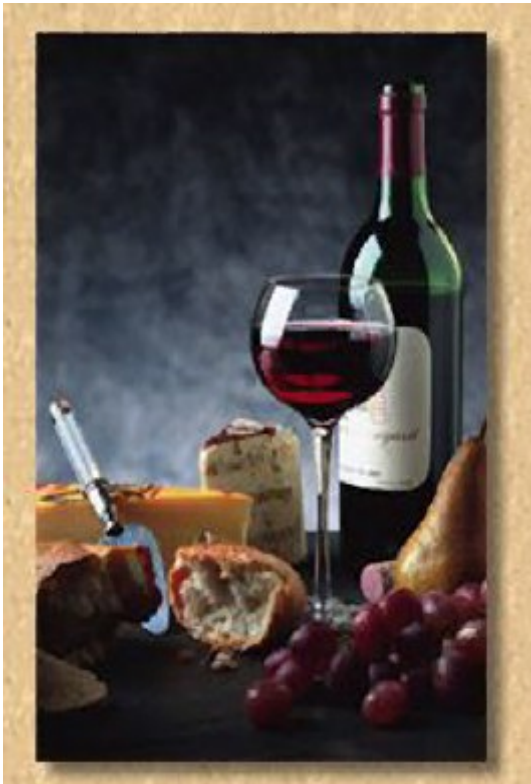
Illustration by Dianne Russell-Cox